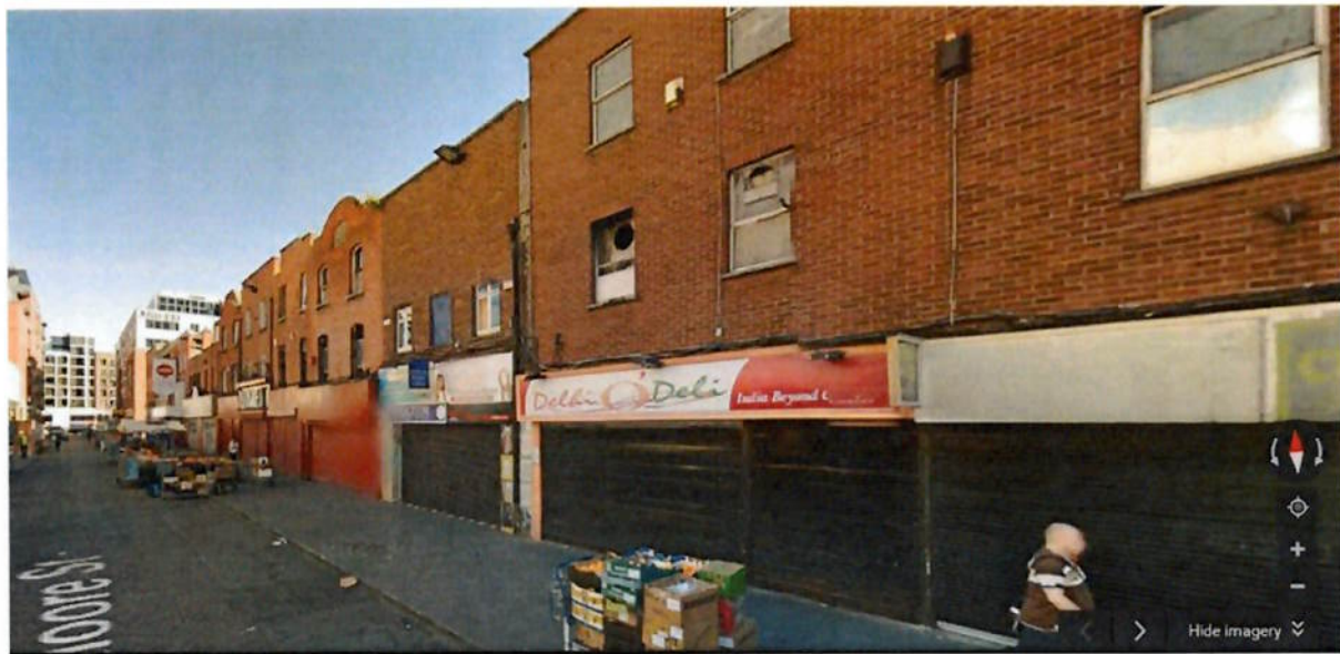
Figure 6: Contemporary photo of Moore Street

In keeping with the treatment of the locations already discussed we aim to restore Moore Street to how it would have appeared in 1916 by replicating and restoring period features and removing modern distractions such as advertising hoardings, road markings etc. Again the street will be pedestrianised in the same manner as the laneways previously discussed with limited access for business traffic such as deliveries. On the street we aim to recreate lifelike British barricades which would have existed at the time.