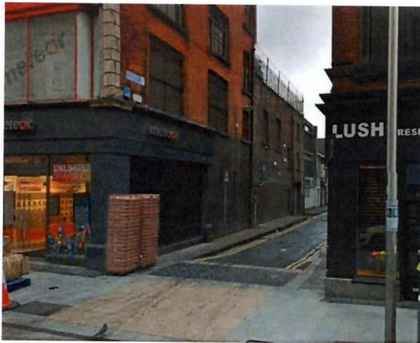
Figure 2: Contemporary photo of entrance to Henry Place

The entrance to Henry Place will be marked with a prominent entrance display such as an overhead informative arch, possibly constructed of wrought iron and/or stained glass.