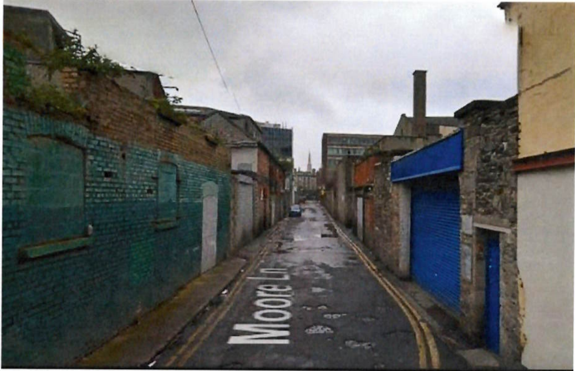
Figure 5: Contemporary photo of Moore Lane

Moore Lane runs along the rear of the Moore Street terrace and is currently badly lit and quite dilapidated. Again we aim, as far as is practicable, to restore this laneway to how it would have appeared in 1916 by replicating and restoring original features such as cobblestones and removing modern signage. This laneway shall also be pedestrianised along the same lines as Henry Place.