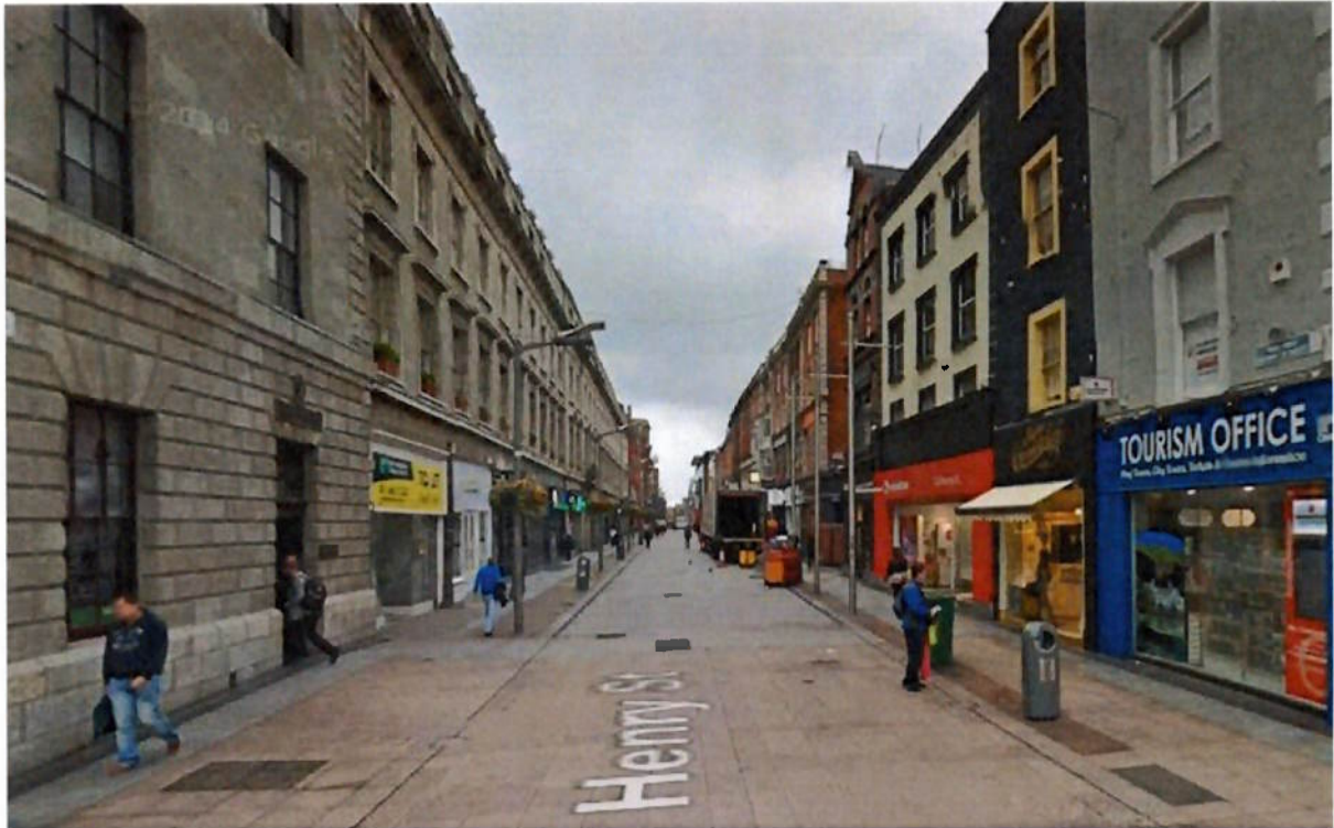
Figure 1: Henry Street where the O'Rahilly and his men left the GPO

Following this initial movement towards Moore Street the remaining 300 or so Volunteers sallied forth under heavy gunfire from the same doorway and headed across Henry Street and into the nearby laneway of Henry Place. The route this main group of Volunteers took across the Battlefield Site will be marked in green footsteps; visitors will literally be able to walk in the footsteps of the 1916 Volunteers and retrace their movements over the entire site.