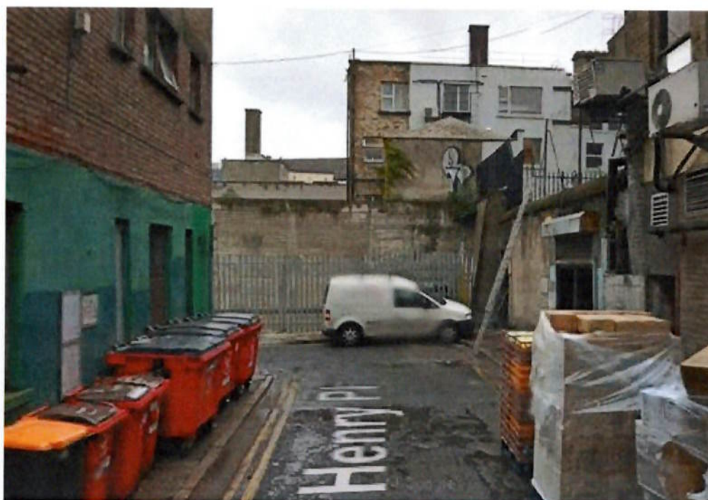
Figure 3: Contemporary photo of junction between Henry Place and Moore Lane

Again we aim to restore, as far as practicable, this area to how it would have appeared in 1916, restoring and highlighting original features as well as removing modern distractions such as contemporary advertisements. This area will also be pedestrianised with limited access for business traffic such as deliveries.