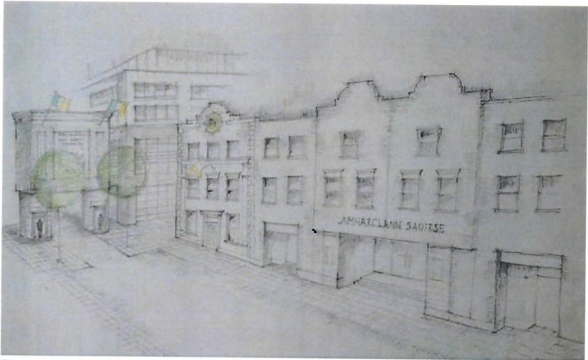
Figure 7: Artists impression of Monumental Arch in Moore Street