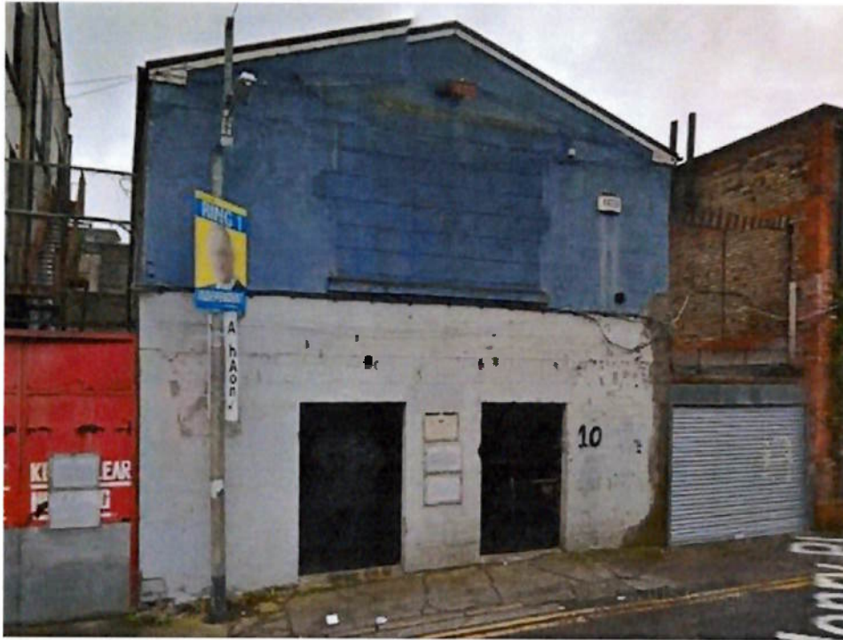
Figure 4: The White House

Tired, hungry and under heavy fire from British weapons including guns, rifles and artillery the Volunteers found themselves in a state of confusion, enveloped by the fog of war. It was at this point that they came to believe that the White House was occupied by British personnel.